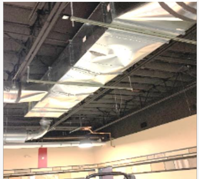
ENTIRE DUCTWORK PRESSURE COLLAPSE